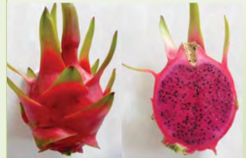
LD.No5 dragon fruit variety