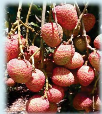
The cultivar 'Early Delight'.

Average yield of producing orchards is around 6-8 tons per hectare, but 20 tons per hectares have been achieved with 'Mauritius' in the early production area of Mpumalanga Province. The harvest season starts in October with 0.1% of the production, peaking in December with 53.9% of the production and ending in March with 0.8% of the production. The majority of the crop is mainly exported to Europe (56%), with Madagascar being South Africa's biggest competitor on this market. Thirty seven percent of the fruit are sold locally and 7% are processed to juice (SALGA, 2012). Over the past 10 years the local market segment has increased due to higher prices as result of better promotion and fruit quality, but also due to expanding metropolitan cities and higher income of a growing middle class population.