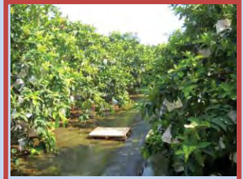
Wax apple orchard

Wax apple ( Syzygiumsamarangense Merr. & Perry) is a popular fruit of Taiwan because of its attractive appearance and taste. The wax apple cultivation in Taiwan is highly concentrated in Pingtung County, accounting for 78% of total planting area. Regardless of the stable demand for the domestic and export markets, the production area in Taiwan has decreased by about 30% in the last decade, mainly due to labor shortage, high technical threshold and production risk. Nevertheless, wax apple cultivation area in the central Taiwan has been increasing in the recent years, especially in Nantou, Chiayi and Yunlin Counties. The extent of production regions brought advantages on year-round fruit supply. The early winter market demand between October and December is filled by the supply from Liukuei district of Kaohsiung city. Produce from the Pingtung area dominates the winter and spring needs from November to May. The cool temperature at the high elevation areas (600-1000 m above sea level) of Chiayi and Nantou facilitates niche market production between June and September. In addition, quality fruits from cultivars with consistent fruit coloring and low cracking can be produced between March and May in Pingtung and between June and September in central Taiwan.