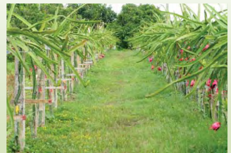
New planting system trial in orchard of SOFRI