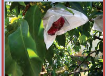
Covering of fruits