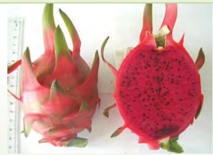
LD.No1 dragon fruit variety

Plants are usually established on well-drained beds. The traditional Mop top production method is followed. Planting density of dragon fruit are about 1,000 – 1,200 supporting posts per ha. Three to four cuttings are used for each post depending on post size and farmer preference. Plants spacing are 2.5m x 3.0m or 3.0m x 3.0m depending on the size of the orchard equipment to be used. Improving sustainable production systems for dragon fruit are being undertaken in collaboration with Plant Food Research (PFR), New Zealand and SOFRI. Agro-techniques were standardized for optimum plant density, pest and disease control, high yield and fruit quality. Spacing depends on framework system and plant structure desired.